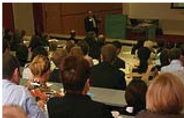
COLLEAGUES ENJOYING CONFERENCE IN GALWAY