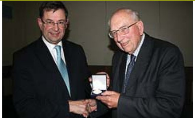
DR KEN WHITAKER RECEIVING HIS AWARD FROM MINISTER EAMON O CUIV